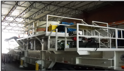
Upper and Lower Access Platforms

*NOTE: Listed weights are not exact. Actual weights will vary based on axle configuration, options, etc.*