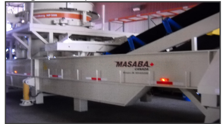
48" Discharge Conveyor