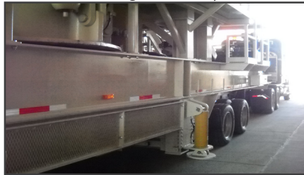
Wide Flange Beam Chassis