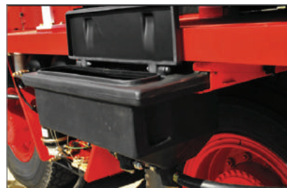
Pull out sander boxes with wide mouth lids for easy loading. Air activated sanders for smooth dispensing.