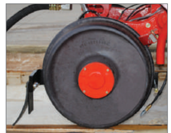
Powerful air knife increases capacities up to 50% in adverse weather.

For narrow or wide applications: Please consult with factory. *Note: Tractive effort may vary with rail and weather conditions. Dimensions and Weight do not include optional equipment. Specifications are subject to change without notice.