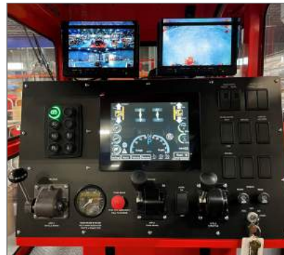
180-degree rotating console with multifunction display. Dual four-way air suspension seats for operation from either side of cab in rail mode. Shown with 4-camera surround.