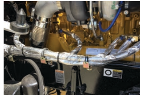
Clean, Organized Hose and Wire Routing