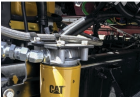
High Efficiency Fuel Filter with High Flow Filter Base