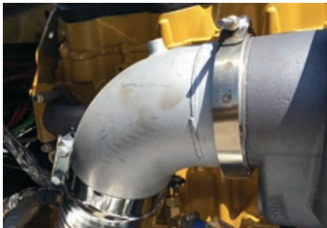
Full 5" Turbo Back Exhaust

Here are just a few options you can add to your custom truck