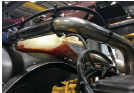
Stainless Steel Coolant Tubes