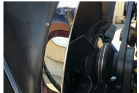
Proper Clearance of Fan Blade and Shroud for Maximum Cooling Capacity

13 Full Truck Service Locations in Pennsylvania and West Virginia 800.538.1020