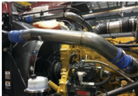
Polished Air to Air Tubing